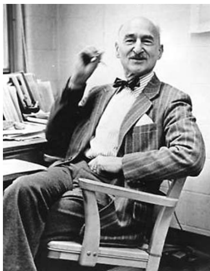
Indiana Alumni Magazine