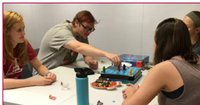
Images from our reoccurring game nights and the Nikolausfeier (Christmas Party) 2017